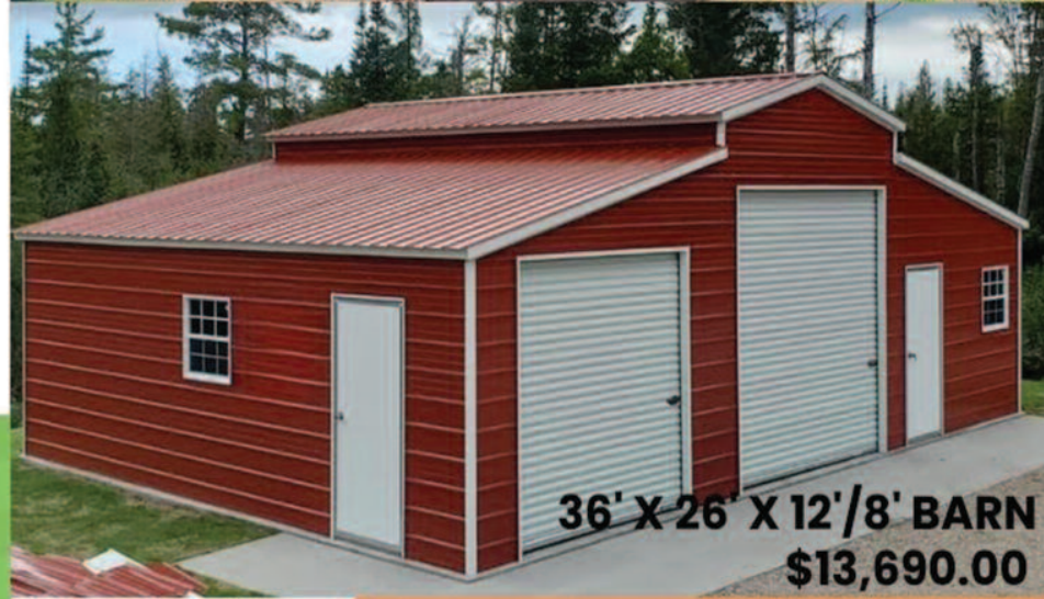
36' X 26' X 12'/8' BARN $13,690.00

Georgia EST. 1990 NATIONAL FAIR OCTOBER 5-15, 2023