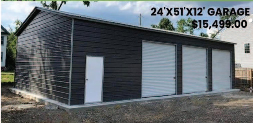
24'X51'X12' GARAGE $15,499.00

Georgia EST. 1990 NATIONAL FAIR OCTOBER 5-15, 2023