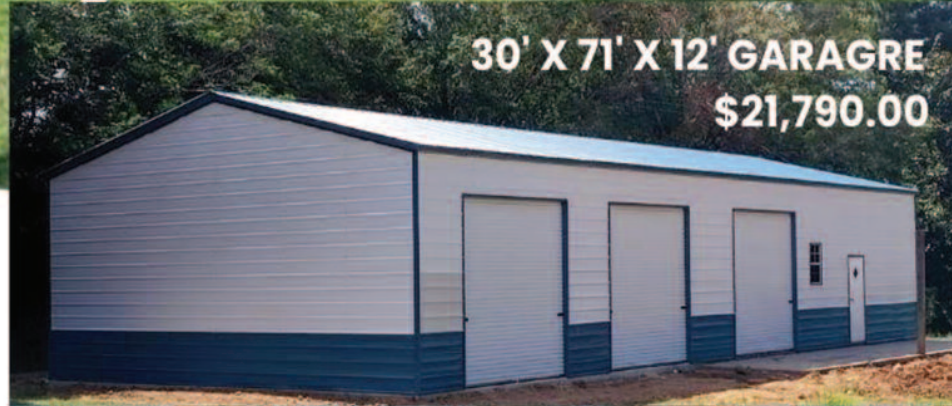
30' X 71' X 12' GARAGRE $21,790.00